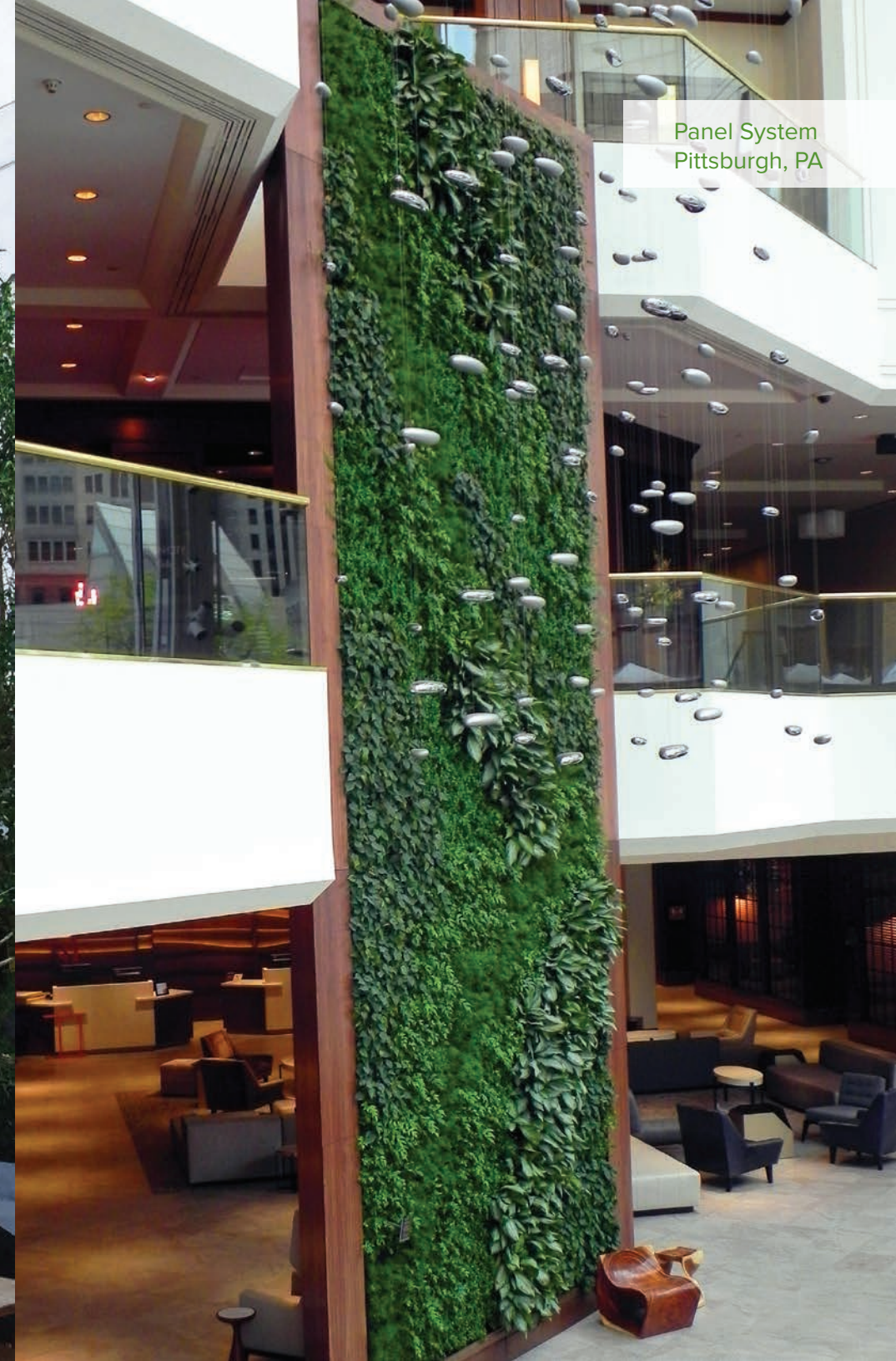
Panel System Pittsburgh, PA