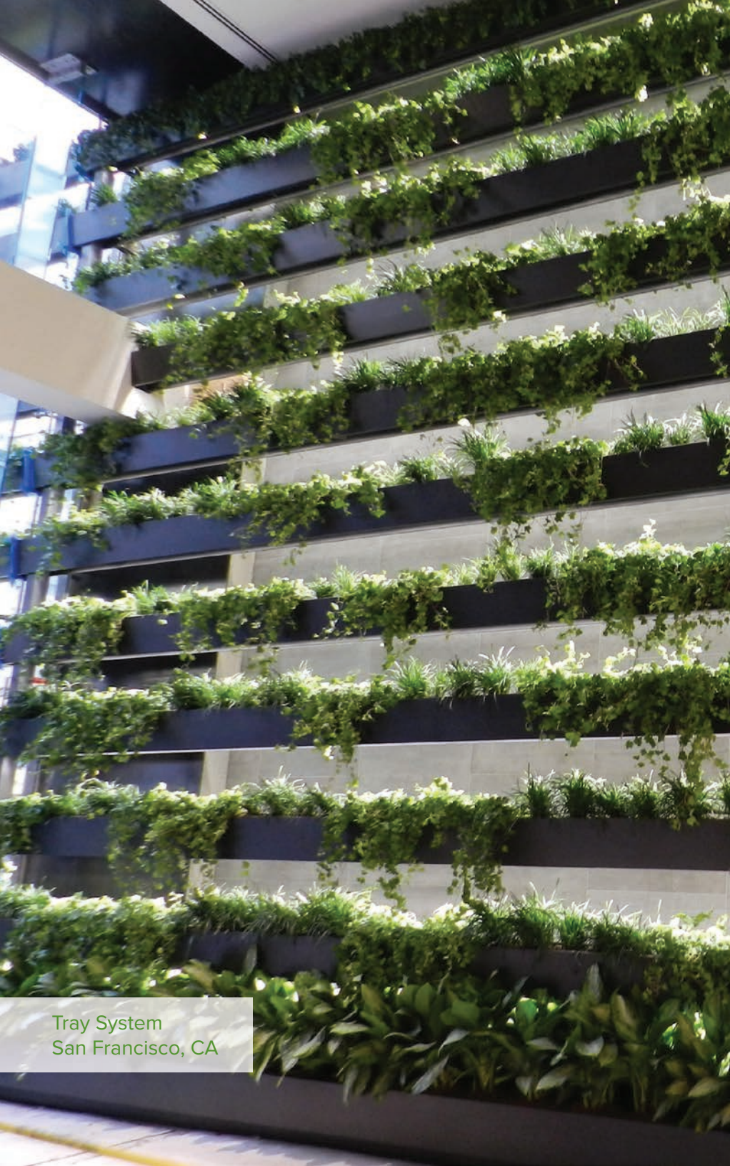
Tray System San Francisco, CA