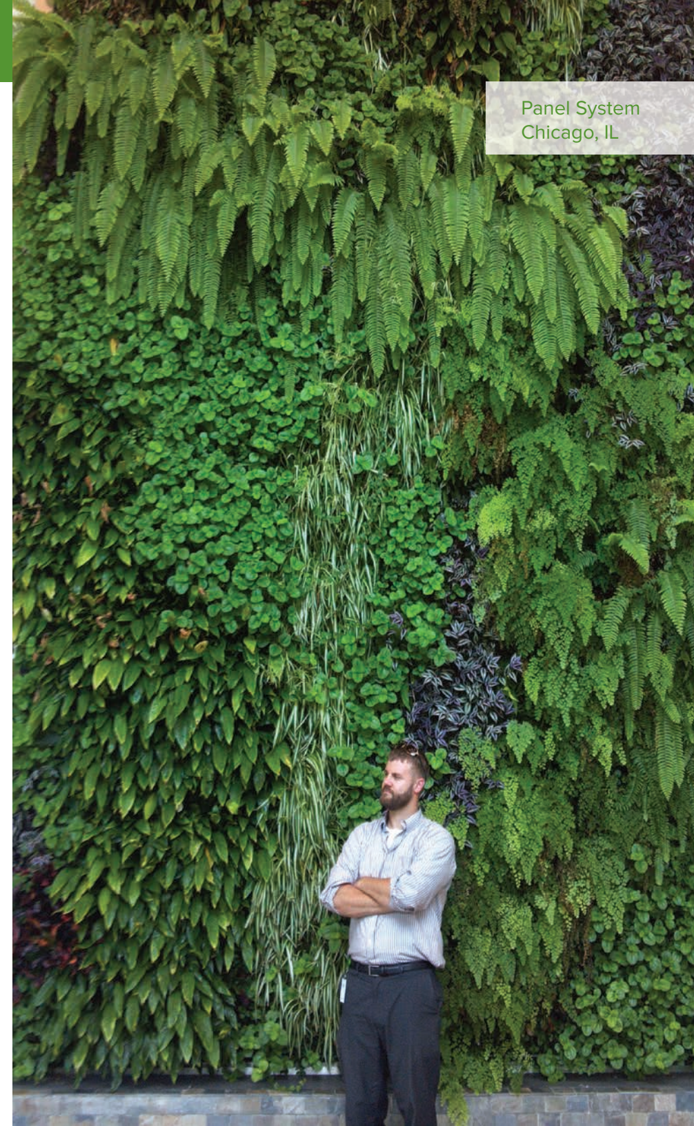
Panel System Chicago, IL

Humans crave connection with nature. Yet, people spend a staggering amount of time in the built environment. Vertical gardens are signature architectural features that transform ordinary walls into dynamic, vibrant spaces. Without taking up valuable square footage, green walls provide a natural refuge that is an important factor in biophilic design and well-being.