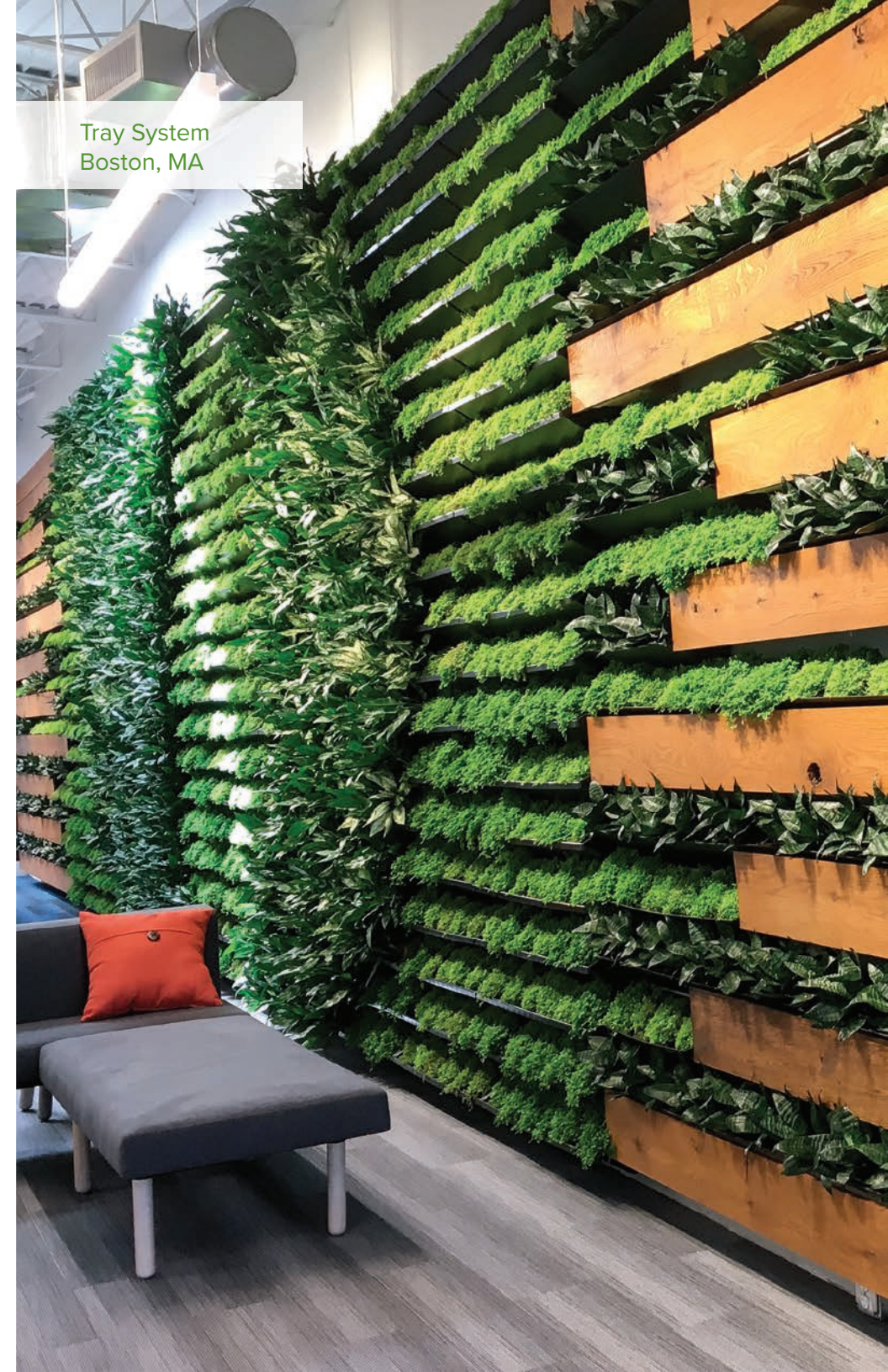
Tray System Boston, MA