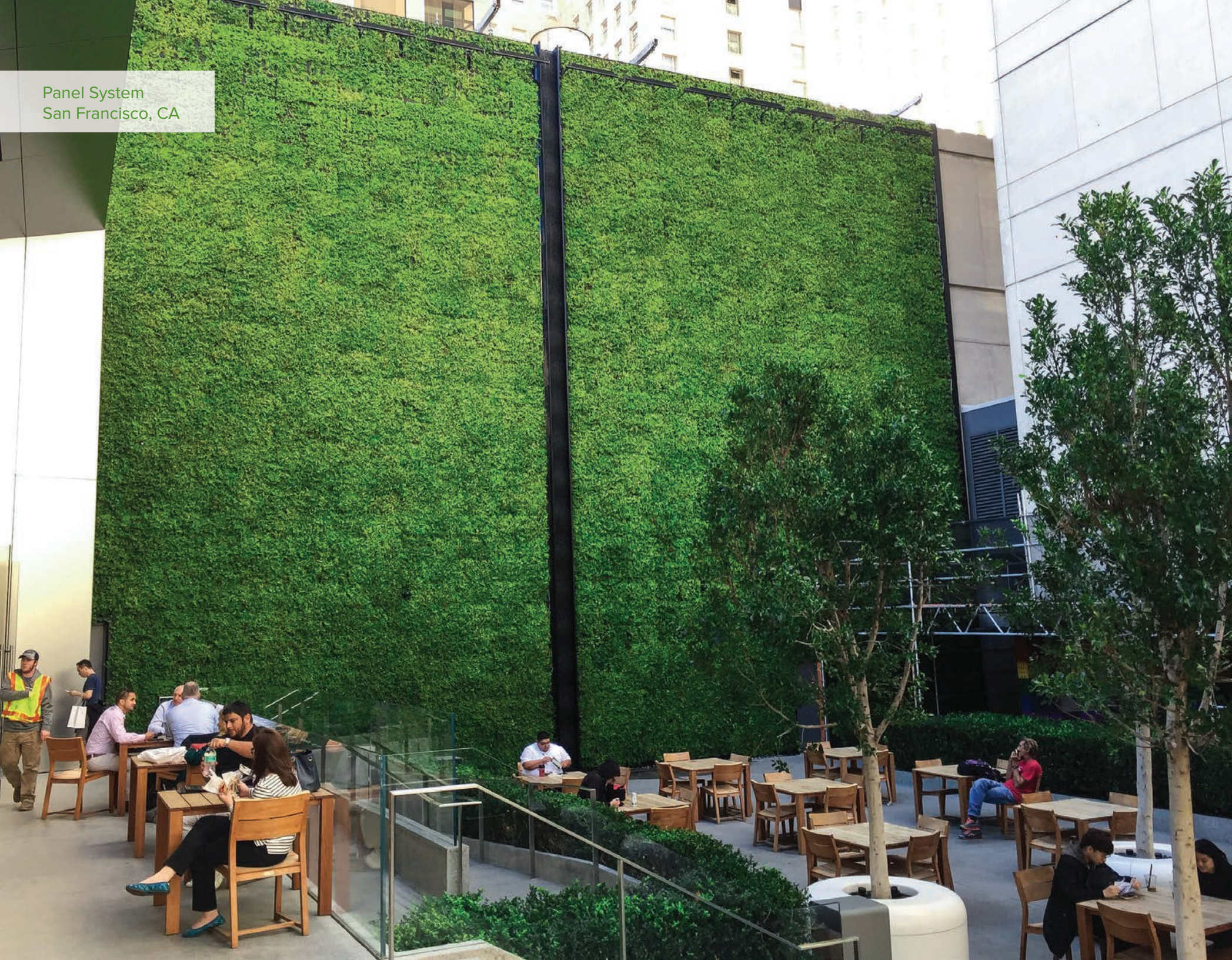
Panel System San Francisco, CA