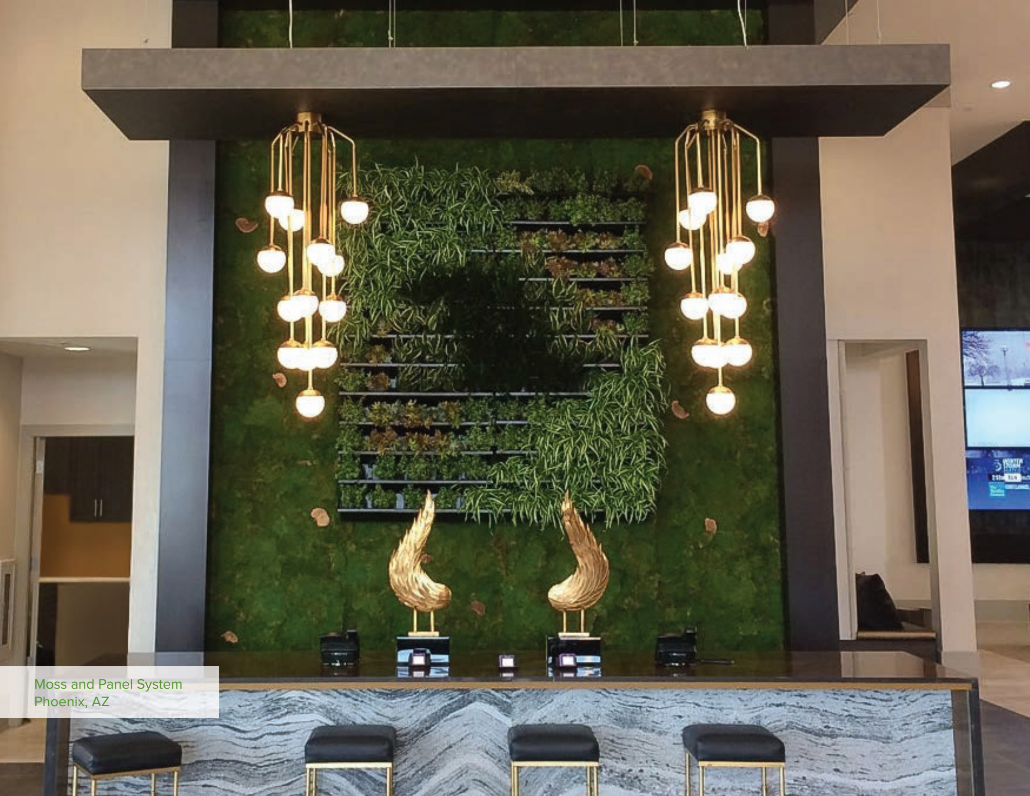
Moss and Panel System Phoenix, AZ