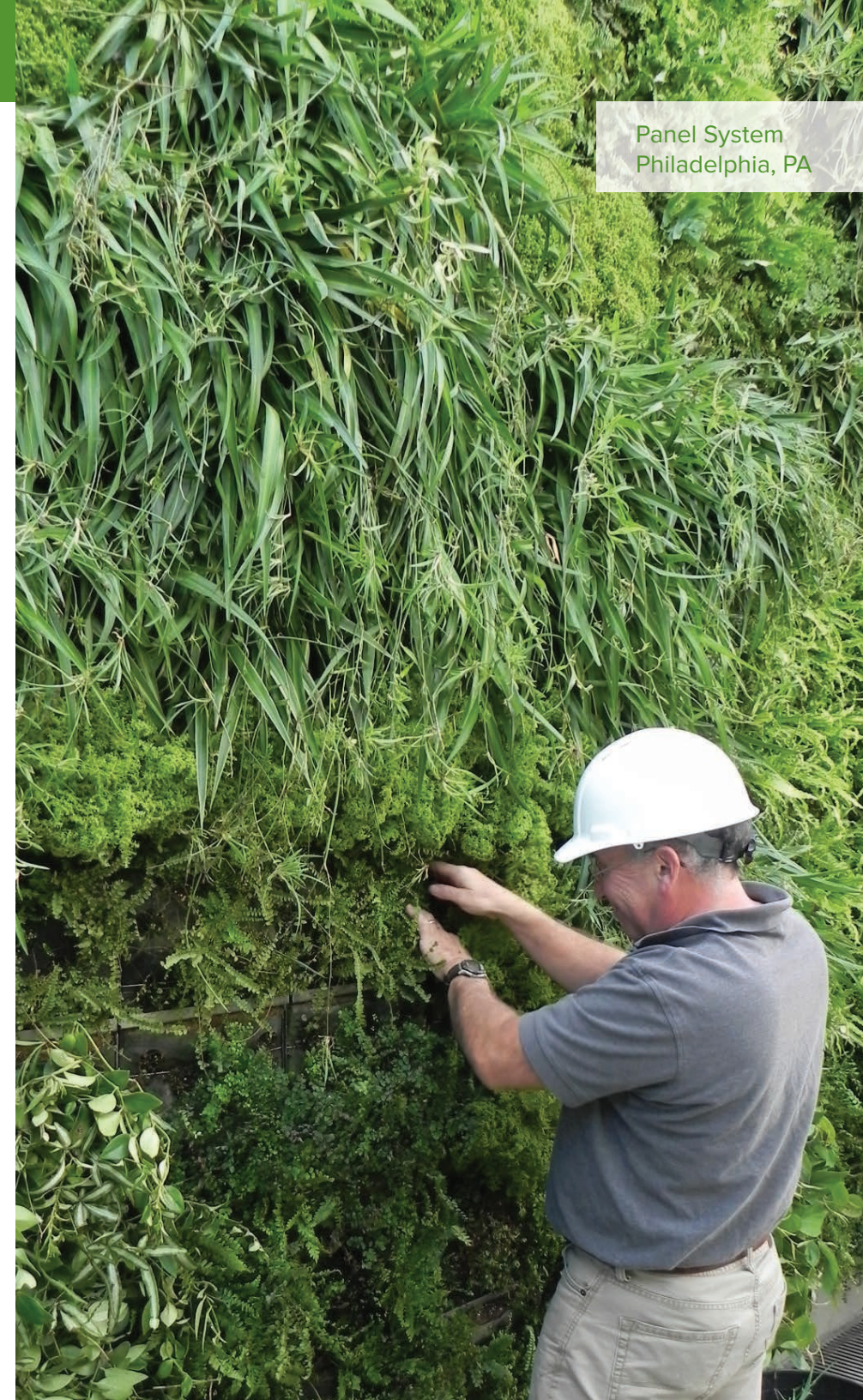
Panel System Philadelphia, PA