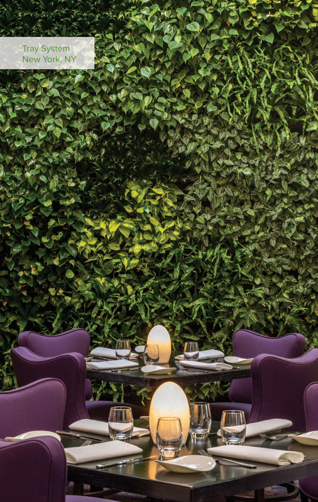
Tray System New York, NY