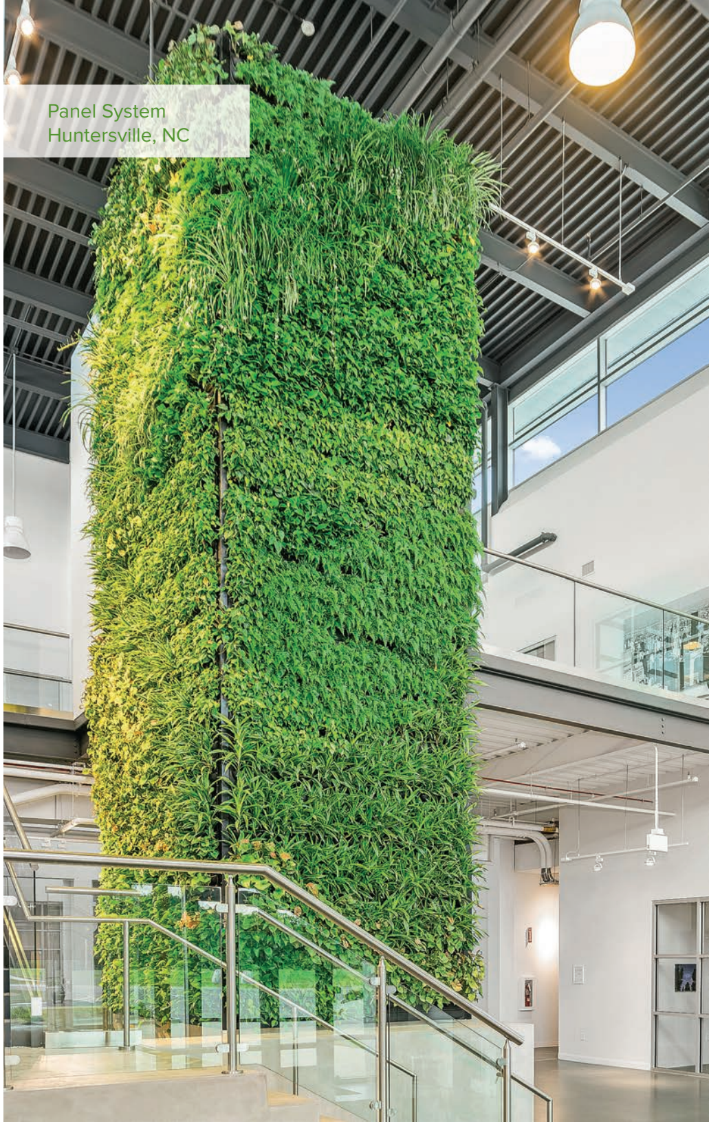
Panel System Huntersville, NC