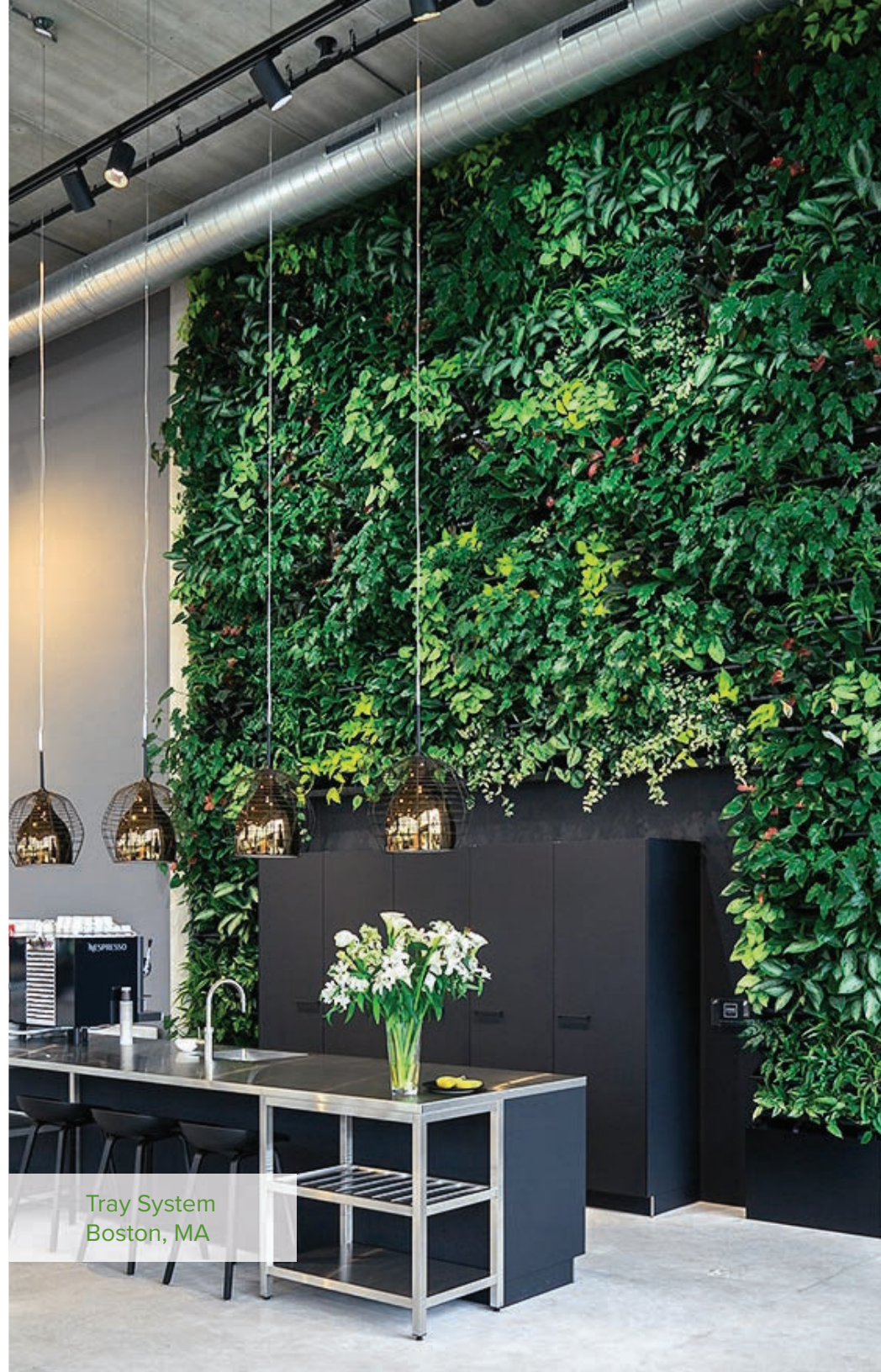
Tray System Boston, MA