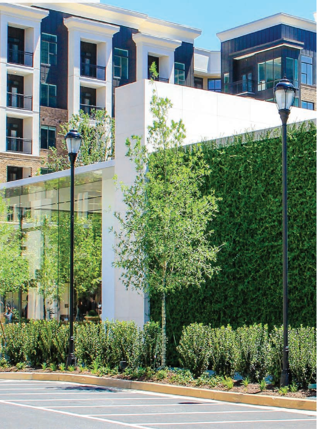
Panel System Alpharetta, GA