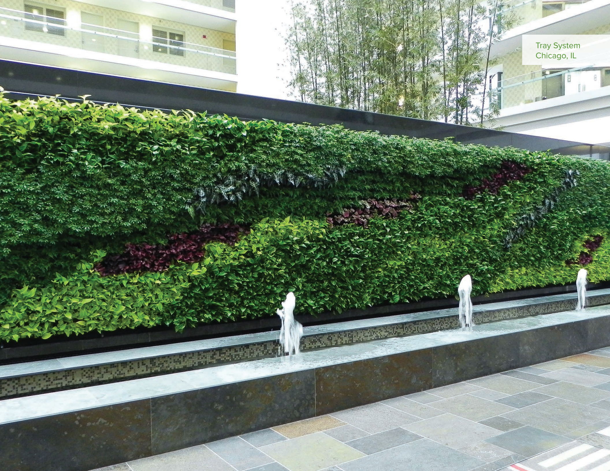
Tray System Chicago, IL