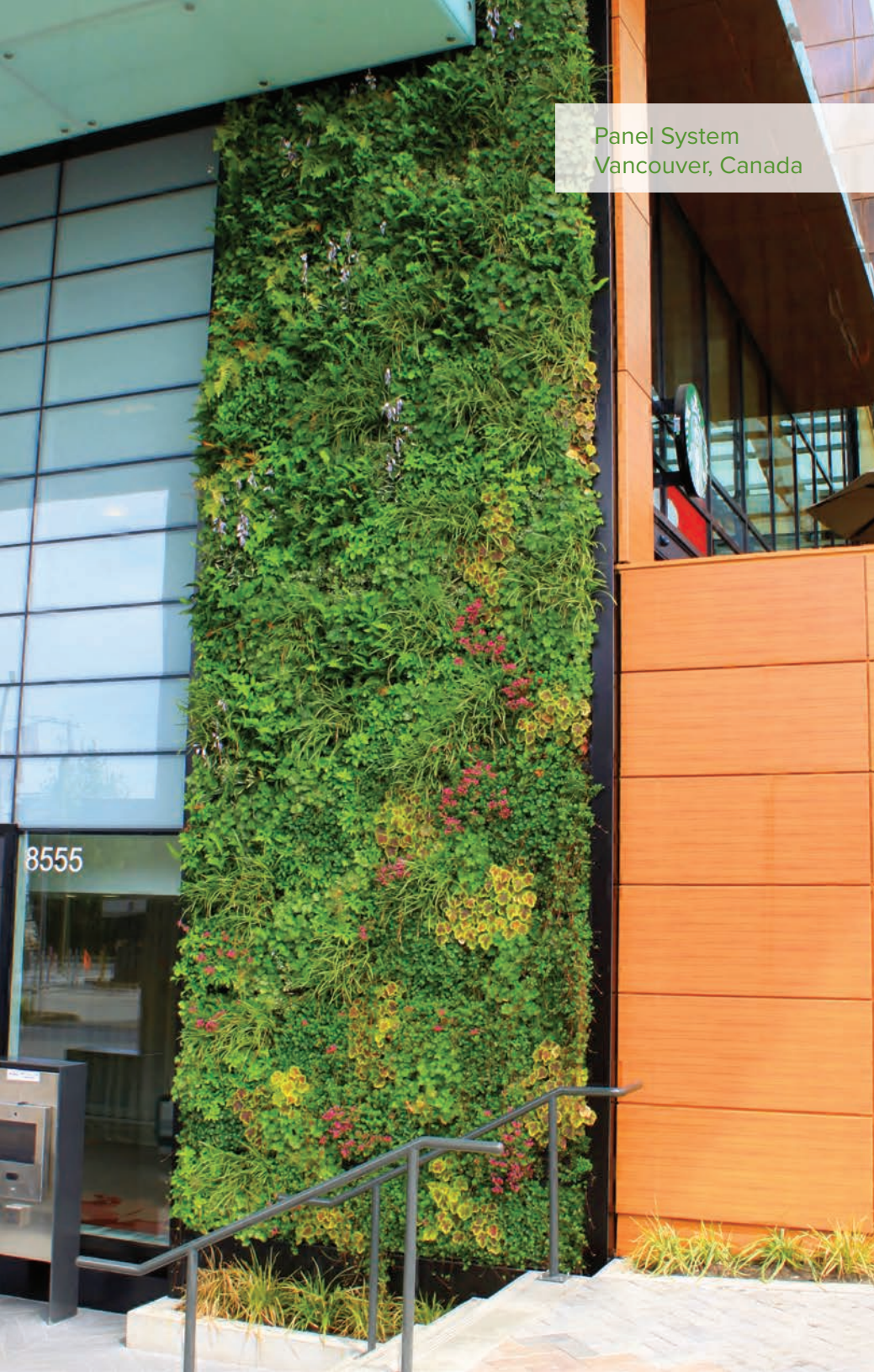
Panel System Vancouver, Canada